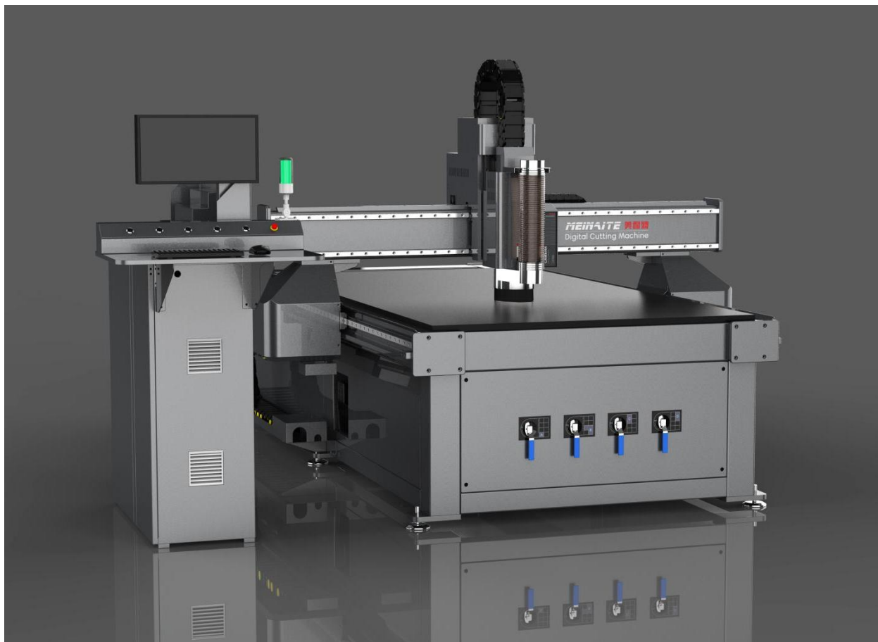
T5 — CNC Router