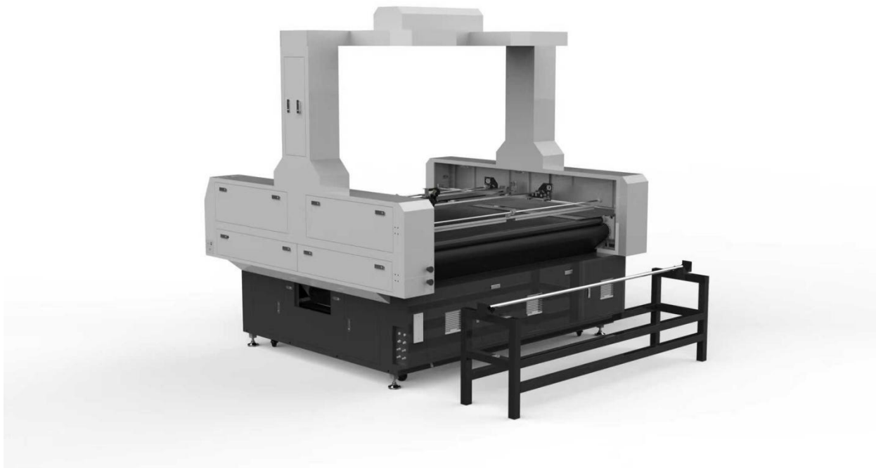
X1814 — CO2 Laser Cutting Machine (Fabric)