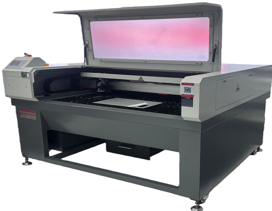
X2-1390 — Laser Cutting Machine